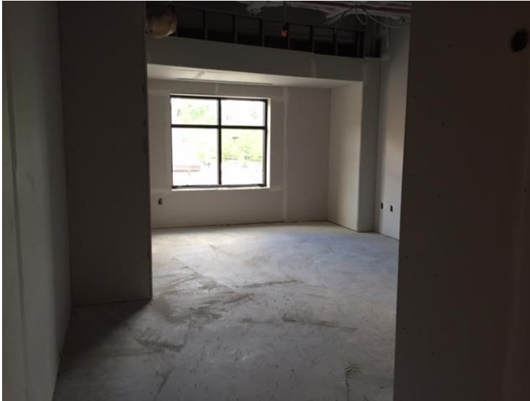
Looking into a room from the hallway.

It's hard to believe how quickly time goes by and as a result the construction of the new addition is within four months of being completed. Following the completion of the new addition, construction will begin immediately on the conversion of the small semi-private rooms to private rooms.