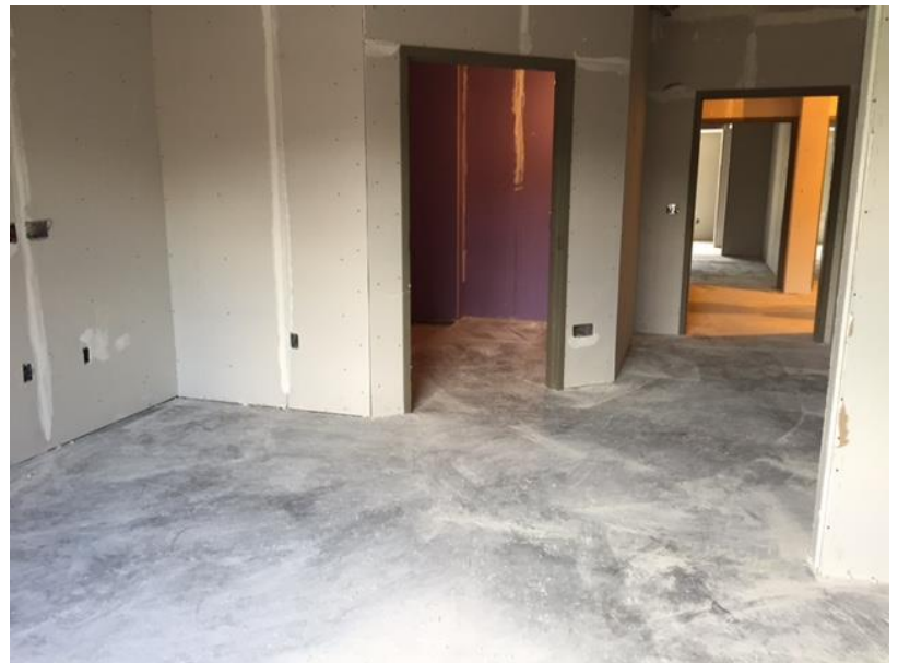
In a room looking to the bathroom and hallway.

We also hope to get some of the landscaping work started in the courtyard area so residents can enjoy the outdoors this summer. We look forward to the completion of the addition and moving residents into the new space.